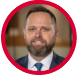
Mayor Mike MENDENHALL