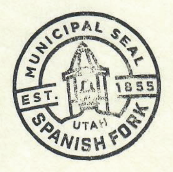
Tara Silver, City Recorder